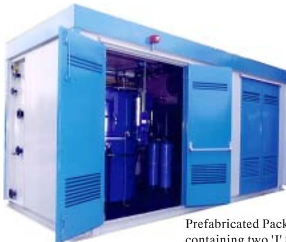
Prefabricated Packaged Plant Room containing two 'J' Series boilers complete with ancillary equipment.